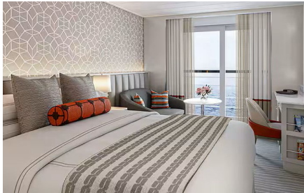
French Veranda Approx. 240 ft 2 from $2,998 pp