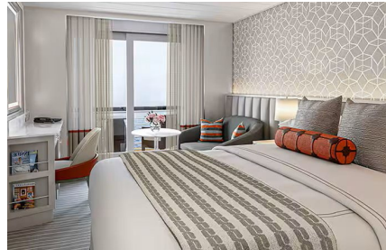
Veranda Stateroom Approx. 291 ft 2 (incl balcony) from $3,648 pp