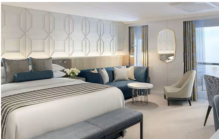
Penthouse Suite Approx. 440 ft 2 (incl balcony) from $4,998 pp