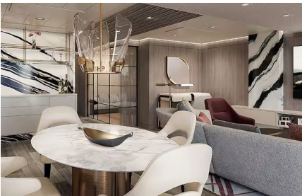
Oceania Suite Approx 1000 ft 2 (incl balcony) from $8,598 pp